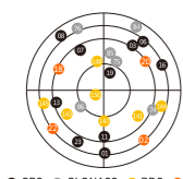
● GPS ● GLONASS ● BDS ● GALILEO