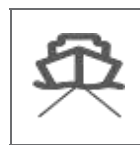
Water conservancy mapping of rivers and lakes