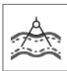
Ultra-shallow water measurement